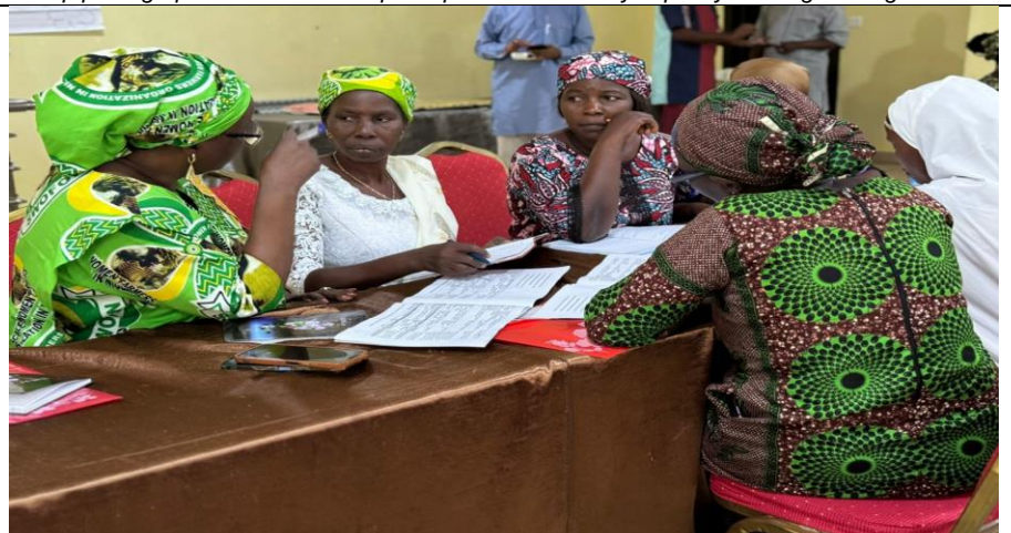
A representative of Jigawa State expressing her views during the capacity building training.