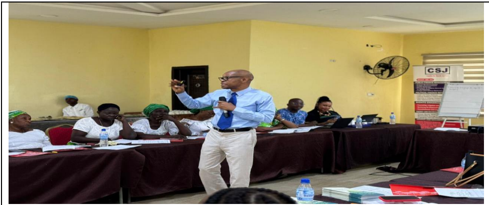
Annex 4: Pictures from Capacity Building Training Workshop