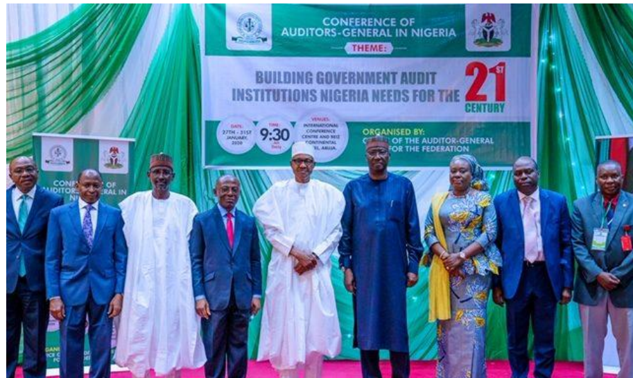
A Cross Section of the Key Dignitaries at the Conference

The central theme of the five-day conference of the Auditors-General in Nigeria, which held on the 27 th -31 st January, 2020, was "building government audit institution Nigeria needs for the 21 st Century.