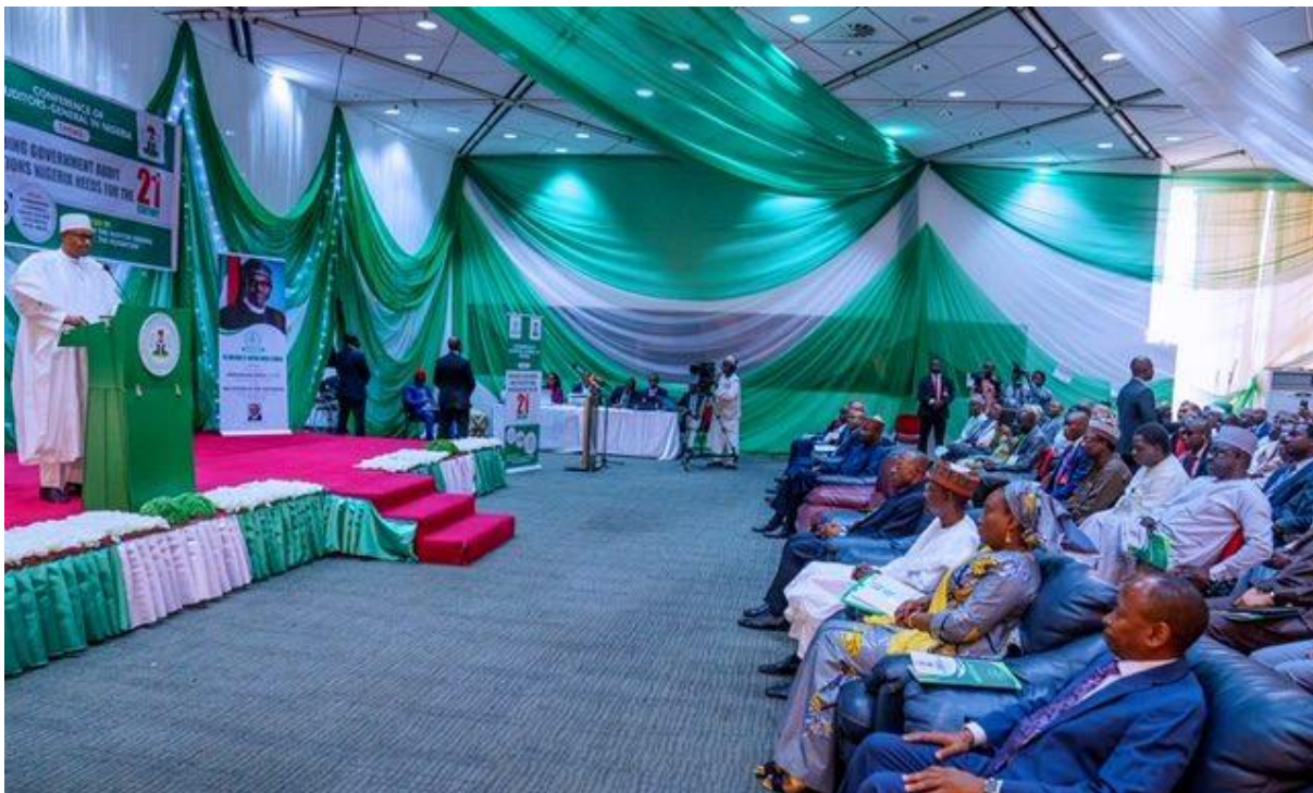
President Buhari addressing the participants at the Conference

quality audits. He stated thus: “we as a people must also have a mindset that shuns corrupt practices and focuses on the wider public good. No one in the government should be afraid of audit if they have done the right thing” . While speaking on the latest report of the Auditor General (the 2017 report) and the one before it (the 2016 edition), he noted that the opinions of the Auditor General for the Federation was reflective of the current reality of corruption, mismanagement and misappropriation issues facing the country. President Buhari noted that the anticorruption fight cannot be won unless the three tiers of government and indeed, all Nigerians are determined to support and join the fight against corruption. Furthermore, he called for audits to be impactful, be timely and meet international standards while on the other hand, calling for more collaborations between the anti-corruption institution. To end his speech, the President commended the Auditor General for his diligence and hard work while pointing out that with the aid of audit findings and recommendations, infractions and corrupt practices can be curbed and loopholes blocked before they are exploited.